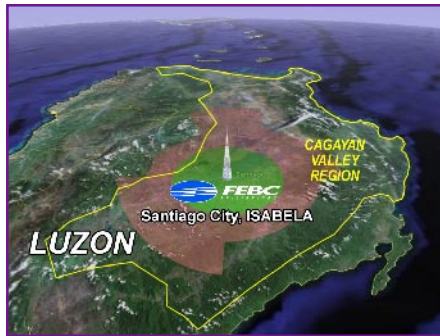
The proposed transmitter site.

Very soon, the people in Cagayan Valley, as well as those in some parts of the Cordillera Autonomous Region, will be able hear the Good News of our Lord Jesus Christ. The Cagayan Valley Missionary Radio Project, already being set up in Santiago City, Isabela, is expected to be on air by the second quarter of 2007.